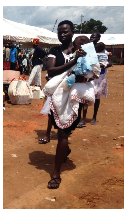
A South Sudanese refugee arrives in Uganda

In December 2013, violence broke out in South Sudan, forcing tens of thousands from their homes; almost overnight Northern Uganda experienced a significant influx of refugees. Between December 2013 and August 2016, the United Nations High Commissioner for Refugees