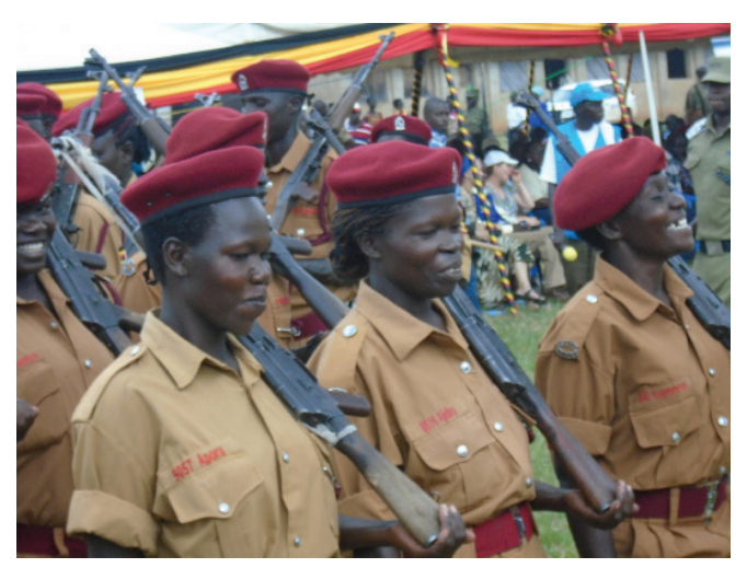
Female officers march during International Women's Day celebrations in Northern Uganda

Additionally, given the intensity of the onset of the humanitarian emergency in Northern Uganda and the sensitivity of SGBV, War