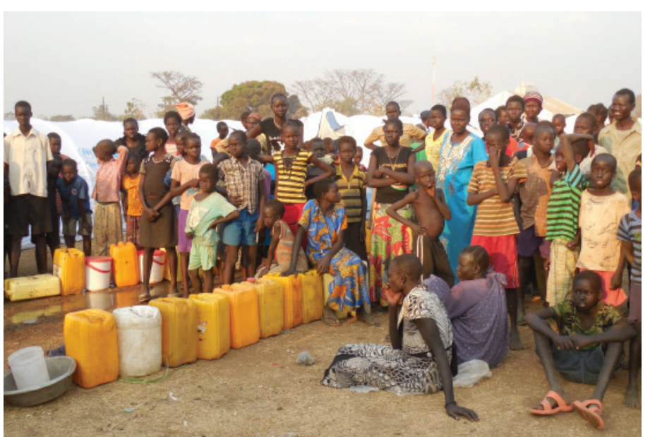
Refugees lined up for water in Adjumani