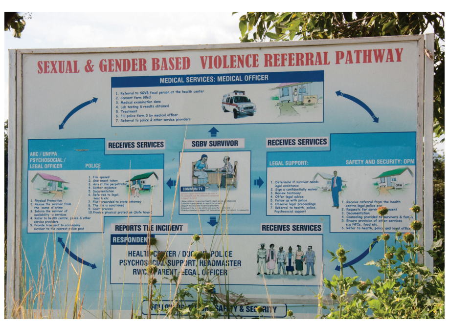
Referral pathway at the entrance of a refugee settlement in Adjumani